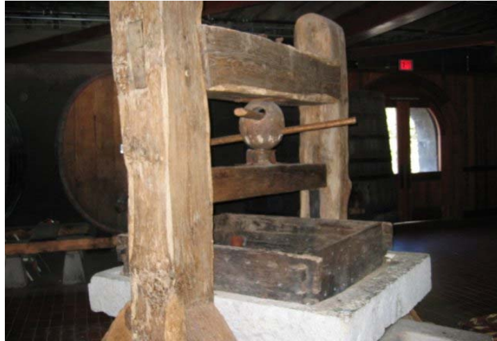
Old- Fashioned Wine Press