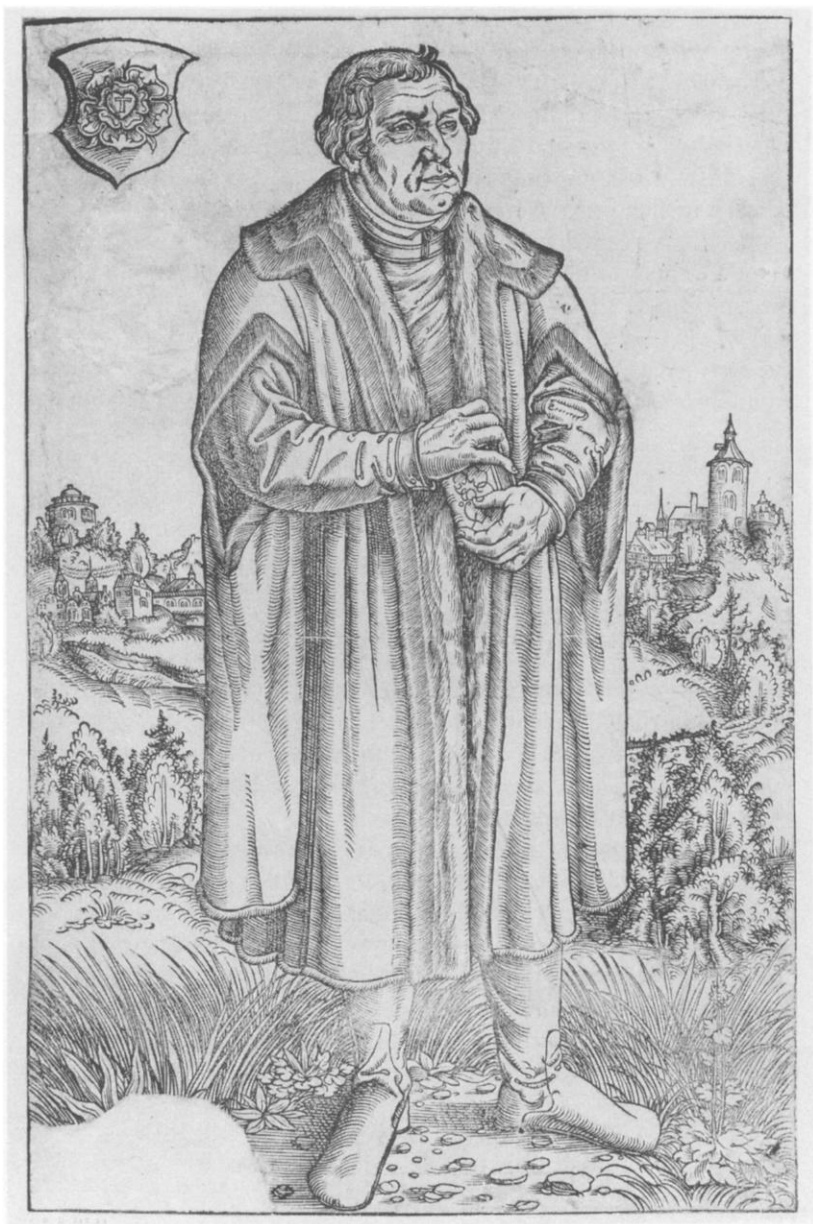
2. Luther aged c. 63, by Lucas Cranach (the Younger?).